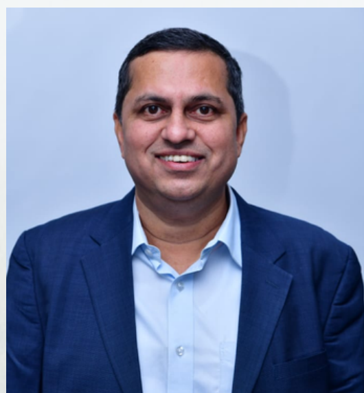
Founder & Director Rosefield Energy tech

Environmental Sustainability is his passion. He has chosen to impart knowledge in this area to a wider audience as climate change has far-reaching consequences on businesses, livelihoods, domestic and international trade.