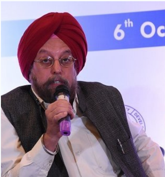
Senior Programme Director CEE