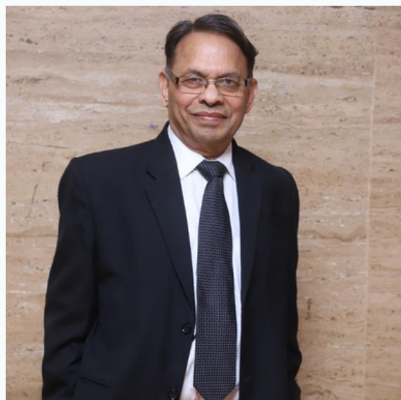
Director EXIM Institute